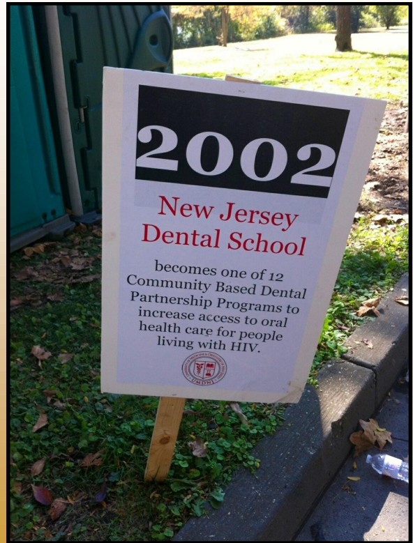
One of the many informational signs at AIDs Walk Philly 2012

Who will cry for the little girl? A little girl she is Who will cry for the little girl? When she is only sixteen Who will cry for the little girl? When she is lonely and can't see When she is dying of HIV Who will cry for the little girl? When she is in pain from her past hurts Who will cry? I will cry for the little girl.